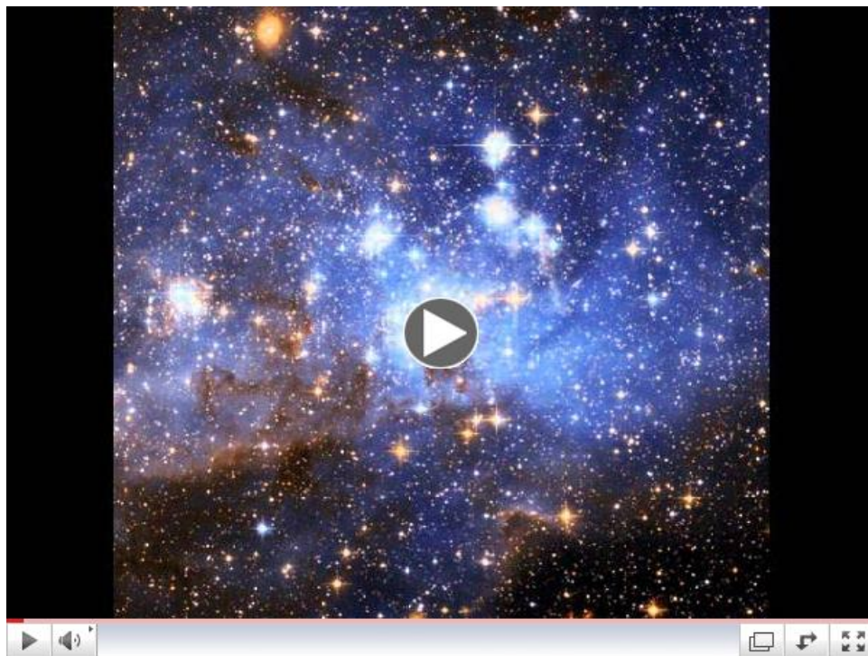
Johann Ludwig Krebs (1713 - 1780) Fantasia for Oboe and Organ \Giacomo Leopardi - L'Infinito

On October 12, 1713, German composer and musician Johann Ludwig Krebs was baptized. I was a student of Johann Sebastian Bach and is thought by some to have the the composer of the "Eight Little Preludes and Fugues" attributed to J.S. Bach. Here is a recording of Krebs's beautiful Fantasia in F minor for oboe and organ.