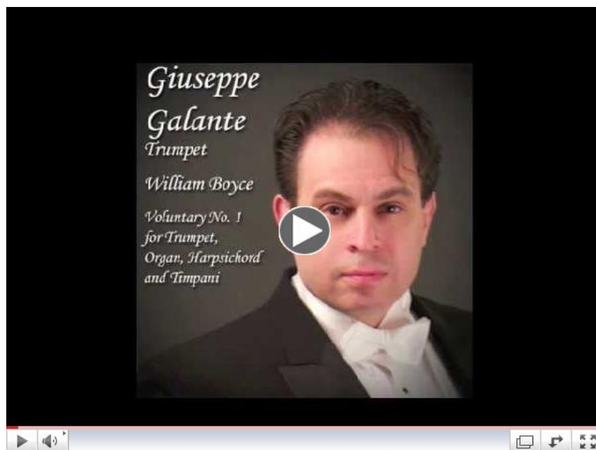
William Boyce: Voluntary No.1 for Trumpet, Organ, Harpsichord and Timpani

in music. In addition to church music Boyce wrote symphonies and Operas. He published a three volume set, Cathedral Music, (1760-73), the first collection of church music to be printed in score. This collection, which covered three centuries, was not superseded until the mid-19th century. Boyce wrote much organ music that is useful to church organist even today. Here is a bracing performance of his Voluntary No. 1 for Trumpet, organ, harpsichord and tympani.