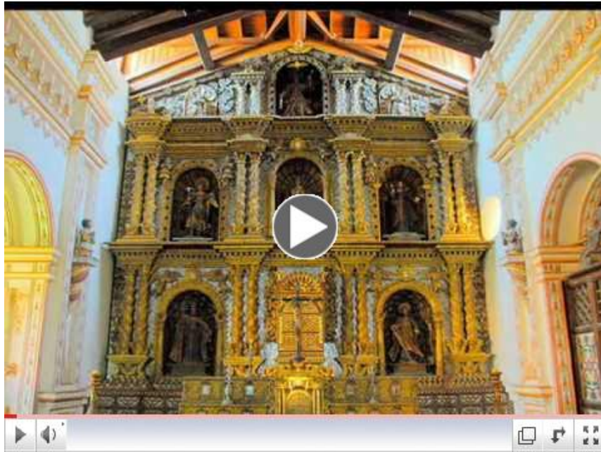
SONATA EN LA MAYOR - Domenico Zipoli (1688 - 1726)