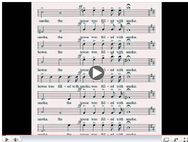
I saw the Lord - Stainer

On this date in 1840 English organist and composer John Stainer was born. He became organist at St. Paul's Cathedral in London where he was influential to future generations of Anglican musicians. His organ method, simply titled, The Organ, was a staple of organ teaching for many years. His work is not much performed these days except his passion oratorio, The Crucifixion, the ever-popular God So Loved the World and the Seven-fold Amen. Stainer's scores can be downloaded from this site or at imslp.org . Here is a link to a performance of his anthem "I saw the Lord."