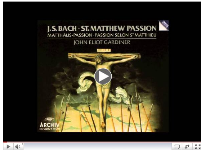
The first chorus from Bach's St. Matthew Passion, conducted by John Eliot Gardner

On this date in 1727 the first performance of Bach's St. Matthew Passion took place, at the St. Thomas Church in Leipzig. Over 100 years later Mendelssohn brought the piece back to life on the concert stage, starting a Bach revival that continues to this day.