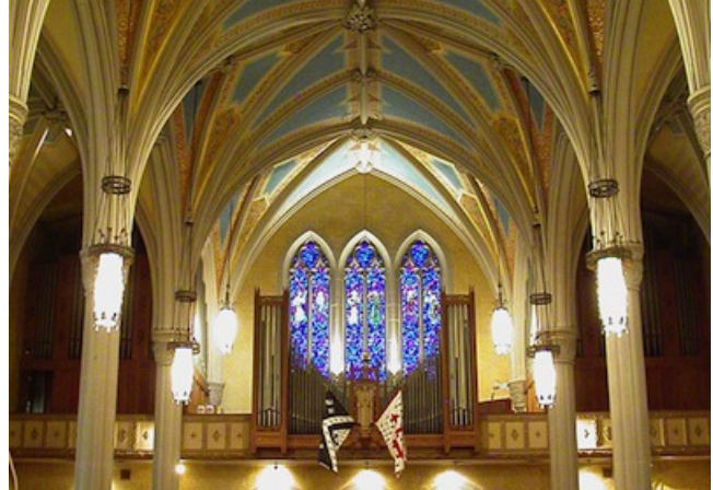
St. John Cathedral

Holtkamp, Sr. of Cleveland's Holtkamp Organ Company at the cost of $45,000, the Cathedral organ comprises a total of 72 ranks distributed over 7 divisions: specifically, 54 ranks in the west Gallery, and 18 ranks in the Chancel at the East End. It is playable from two identical 3 manual consoles: a moveable console located in the west Gallery, and a stationary console located in the Chancel area.