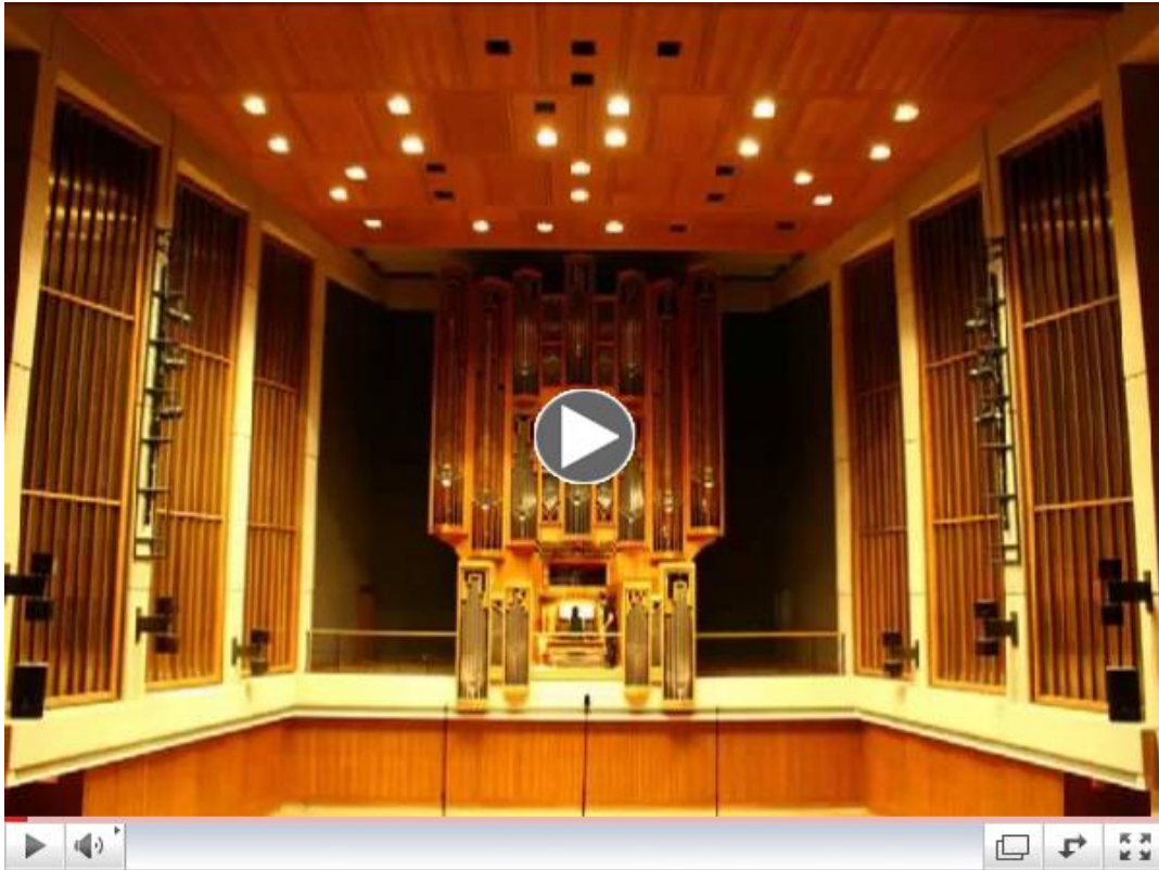
Ned Rorem (b. 1923) - II. "Mary Dyer did hang as a flag" from A Quaker Reader