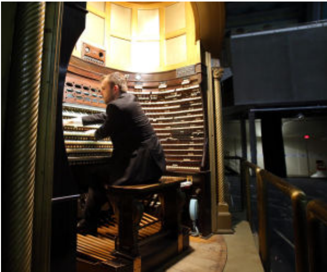
Atlantic City Boardwalk Organ

It wasn't Madonna or Lady Gaga, but the first noontime playing of Boardwalk Hall's historic organ in nearly 70 years Monday was, for a small contingent of music buffs, the venue's show of the year. READ MORE