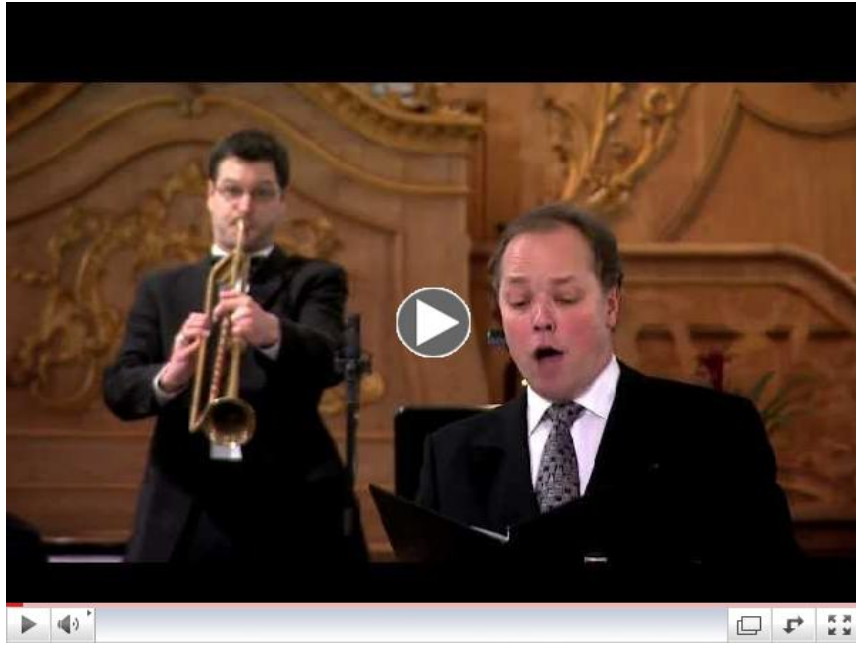
J. S. Bach - Cantata BWV 90 - Es reisset euch ein schrecklich Ende - Aria (J. S. Bach Foundation)