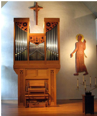
Fairmount Presbyterian Ruggles Organ