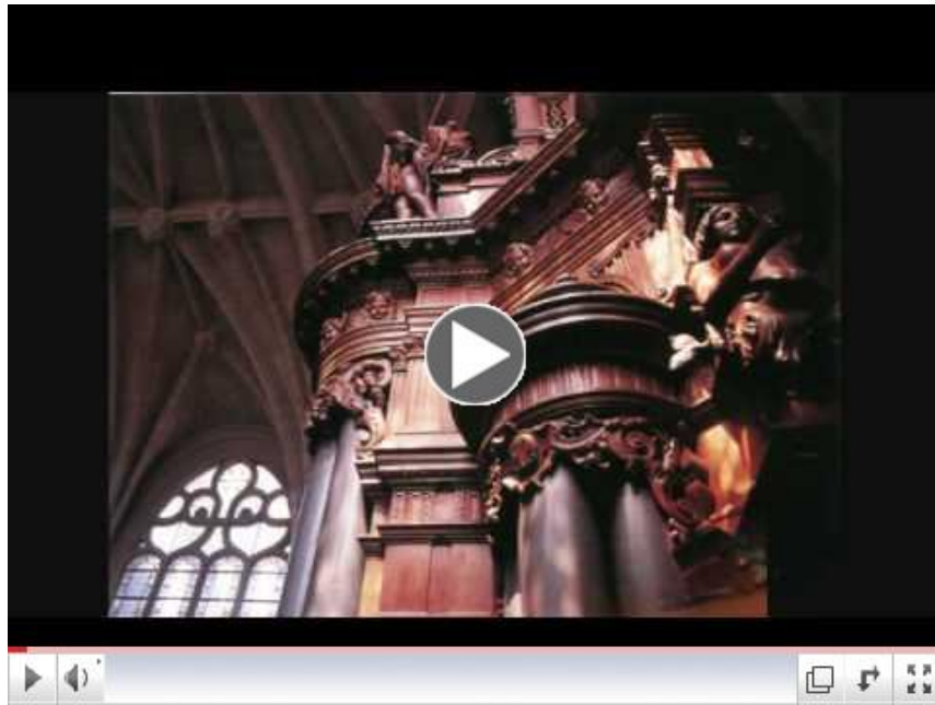
Le Tombeau de Titelouze from St Eustache Part 1