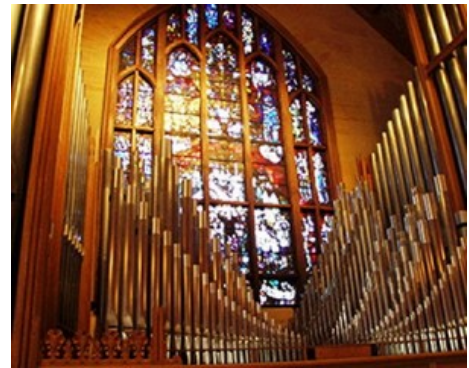
Fairmount Presbyterian Schantz Organ