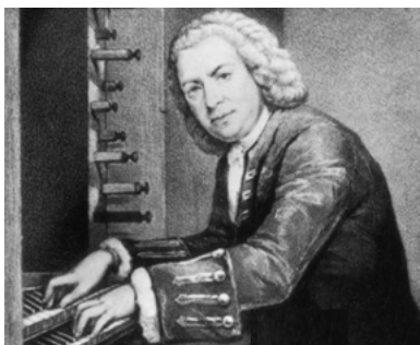
Johann Sebastian Bach