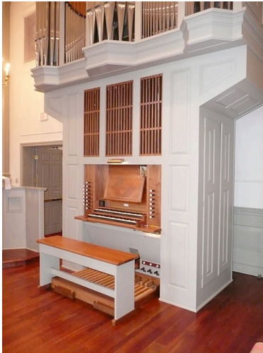
AGO Annual Dinner 2010 May 2, 2010

You are invited to view Greg's photo album: AGO Annual Dinner 2010